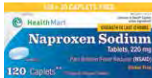
At participating stores while supplies last

Health Mart BONUS NAPROXEN SODIUM 220 mg, Pain Reliever/ Fever Reducer (NSAID) Caplets, 100 + 20 ct