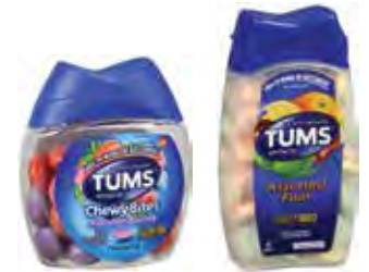
Additional select Tums items where available

TUMS Antacid Chewy Bites, 32 ct or Chewable Tablets, 72 ct