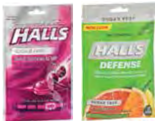
Additional select Halls items where available

HALLS Sugar Free Menthol - Cough Suppressant/ Oral Anesthetic Drops, 25 ct