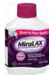
Additional select MiraLAX item where available

MIRALAX Powder Relieves Occasional Constipation/Irregularity 30 Once-Daily Doses 17.9 oz